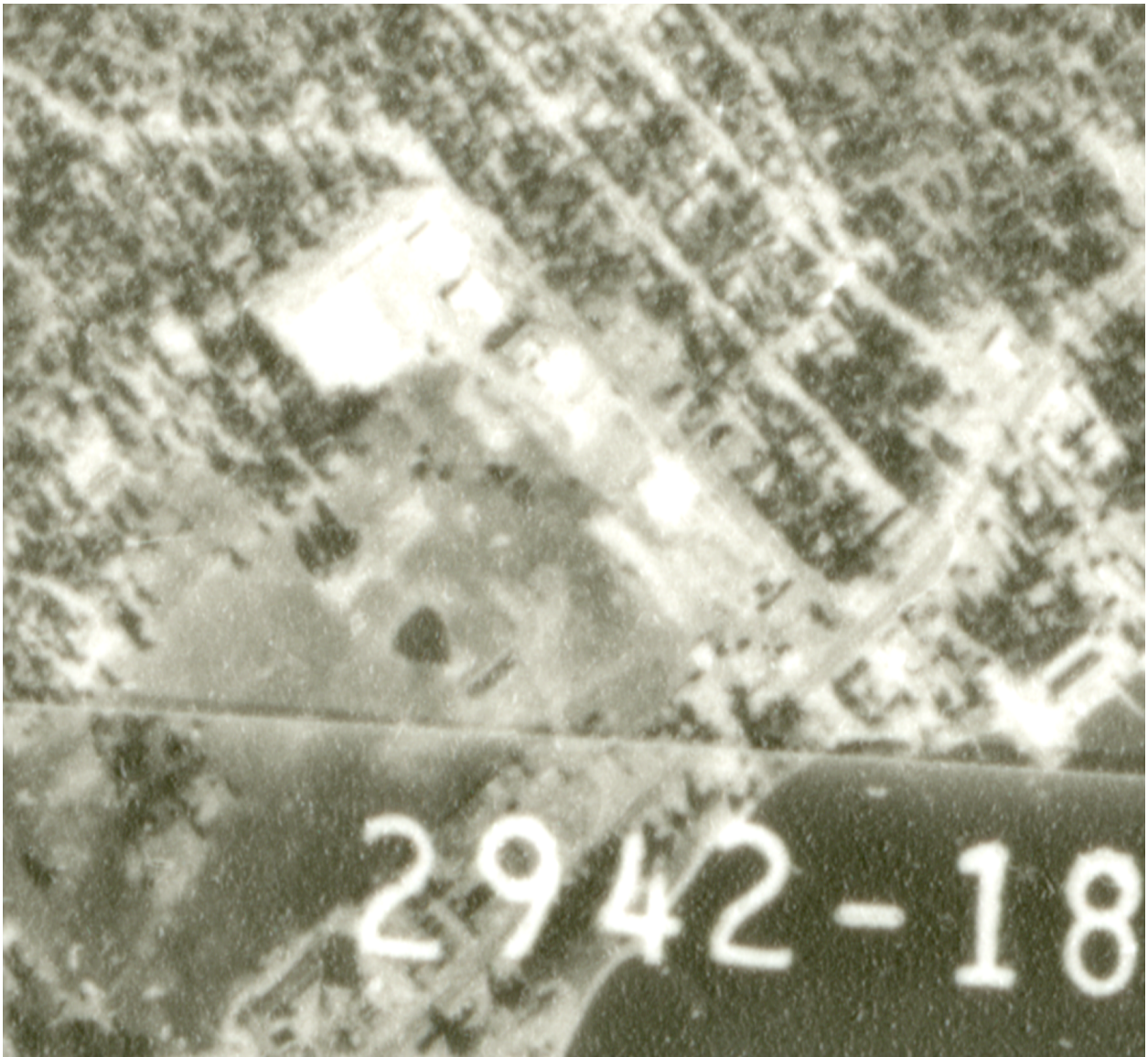
UC Davis, 1971 (flight G4363 p5A4/photo 2942-18-023)