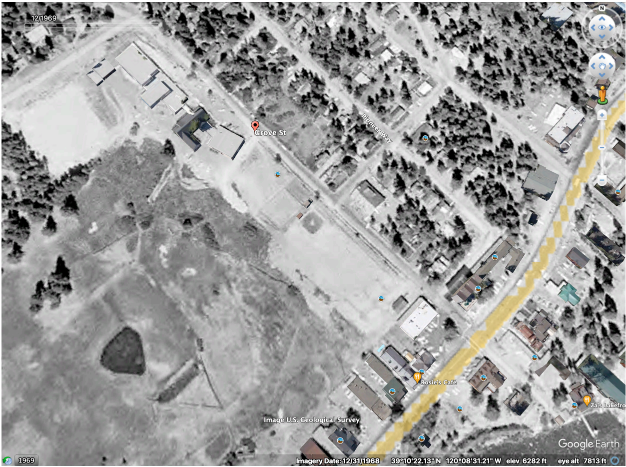
Google Earth, 12/1969